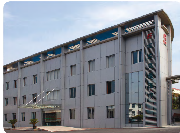
State-of-the-art manufacturing facilities.

That way we know we will be able to deliver the highest quality products to the medical profession both today and way into the future.